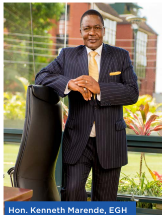
Hon. Kenneth Marende, EGH

Powering people for better lives is our guiding mantra in pursuing business growth and sustainability as well as enabling socio economic progress. As a customer centric Company, our policies, strategies and operations are focused on delighting our customers as expressed in our vision statement.