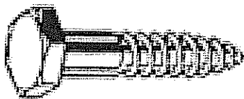
Fig. 2: Coach Screw