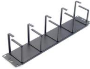
Figure 2 2U-Cable Management Finger Duct