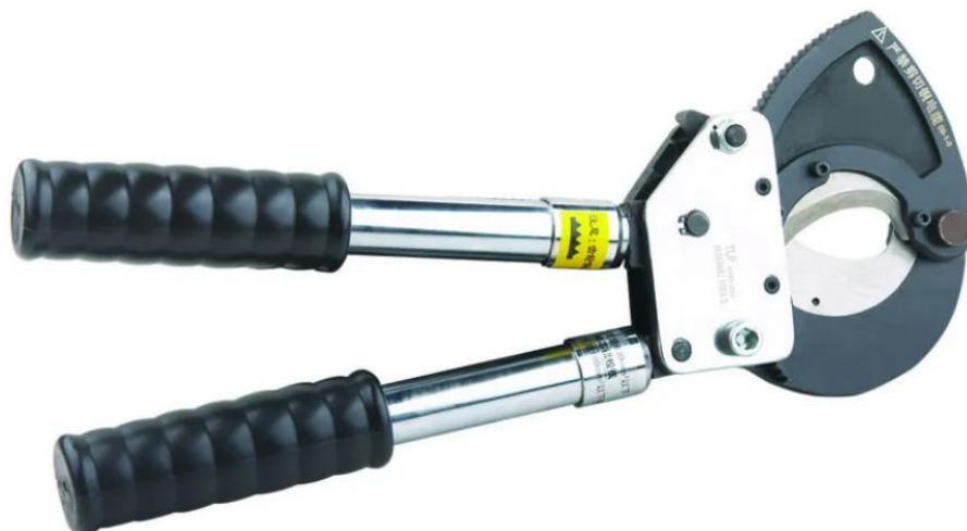
Figure 8 Ratchet hydraulic cable cutter

The Hand operated ratchet hydraulic cable cutter shall be Suitable for aluminium sector cable up to 4 x 150 mm 2 , for cutting copper and aluminium single conductors as well as multiple stranded cables. It shall be fitted with fixed handle with support area for holding when operating the cutter. The blades should be precision-ground and hardened and capable of producing clean and smooth cut without crushing and deformation