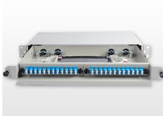
Figure 1 Rack mount Optical Distribution Frame (ODF)