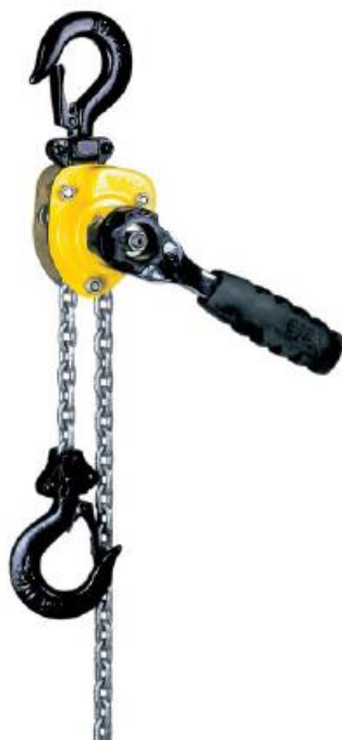
Figure 7 Ratchet lever pull lift

The Hand operated ratchet lever pull hoist shall be 1.5ton low tare weight and a smooth free-chaining device. It shall be made of robust stamped steel construction and be of compact design. It shall be equipped with a hard chromium plated hand wheel and a sturdy bottom block with encapsulated bolt connections to prevent shearing and loosening of nuts. The Chain guide shall be integrated into the housing to eliminate fouling and jamming of the chain on the load sheave. Should have optimized gearing to facilitate operation of the short hand lever with minimum effort. The free chaining device should serve to all quick attachment of the load or to pull the chain through the hoist in both directions.