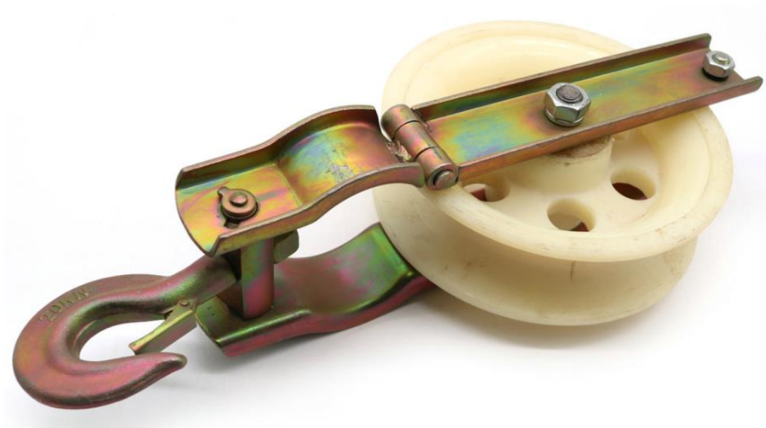
Figure 6 The 7inch String Block Roller

The 7inch string block rollers shall consist of a single roller block frame that is made high strength plastic sheave mounted on anti-friction ball bearings suitable for supporting the ADSS Fiber optic cable during overhead stringing. It shall be used for temporary support of the Fiber cable during network construction. Figure 6 below shows a sample of the 7inch string block roller