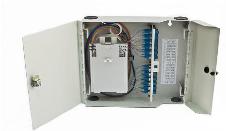
Figure 3 Wall mount Optical Distribution Frame (ODF)

The Indoor Wall Mount Optical Distribution Frame (ODF) shall be used for the termination of the Fibers in the building. The ODF shall be wall mounted and designed to provide protection for fiber splicing of pre-connectorized pigtails and to accommodate connectorized termination and coupling of the fiber cables. It shall be supplied complete with 48 port patch panel, SM pigtails with LC\UPC connectors plus adapters, splice tray cassettes, splice sleeves, cable glands and wire management where necessary.