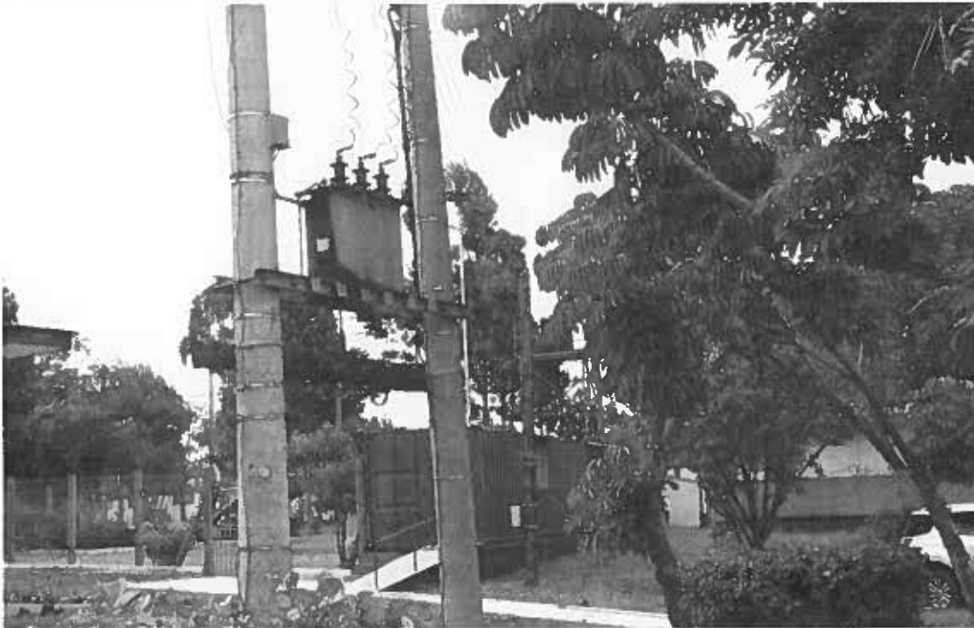
Figure 3: Current status of the proposed site showing the existing 50kVA transformer.

The proposed system shall have the solar PV modules mounted on container roof, with the rest of the components mounted inside the container. The scope of the project shall be as defined below: