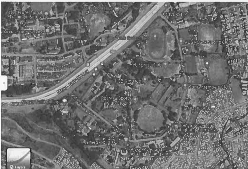
Figure 1: Google map extract of the project location

The map extract for the site is presented in Figure 1.